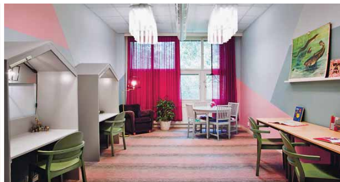
The study room before and after We Unite Design transformed the room. Today the children at the school are inspired to go to their study room and do their homework.