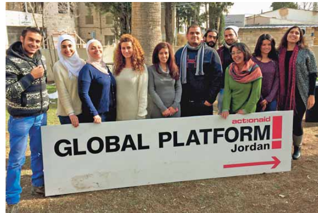
The trainers who participated in SE Forum's Training of Trainers in February 2015, in Amman.

• November & December 2015: ActionAid executes its own regional Training of Trainers program in Amman, Jordan with 24 participants from 5 different countries (Jordan, Egypt, Tunisia, Palestine and Lebanon) with the goal to scale the initiative to additional countries in the Middle East throughout 2016.