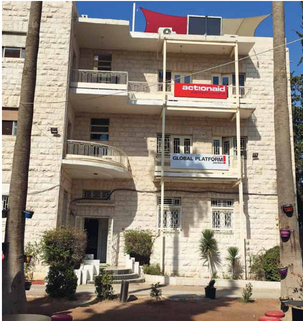
ActionAid and Global Platform's joint office in Amman, where the Training of Trainers was held.

SE Training of Trainers is a two week skills sharing and capacity building program that equips participants with the tools they need to empower other social entrepreneurs.