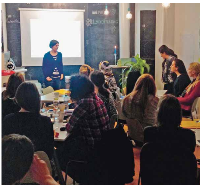
SEWoman participants at a workshop with members from SE Forum team and board.