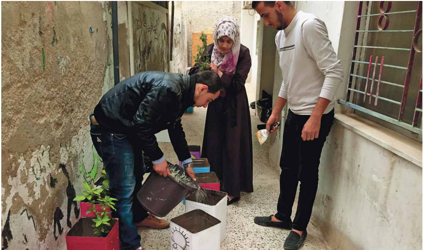
Nabta wa Tanaka ("plant in a can") is one of the social enterprises developed out of the trainings in Jordan. They grow organic herbs and sell them at cheap prices in recycled cans

As a result of the partnership, ActionAid held workshops with 47 participants throughout Jordan and Lebanon in 2015. The majority of the participants were between the ages of 18 and 30. In addition, ActionAid hosted its own Training of Trainers for 24 participants from the region, representing Jordan, Egypt, Tunisia, Palestine and Lebanon. The goal was to equip them with the skills to run trainings and workshops in their countries throughout 2016 in order to impact as many people as possible while ensuring social entrepreneurs receive the local context and networks needed to have onthe-ground support and mentorship.